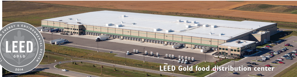
LEED Gold food distribution center

ation systems result in higher efficiencies. There are improvements in the architectural aesthetics of IMPs. And, there's a large diversity of doors now available for temperature-controlled spaces," says Dohogne.